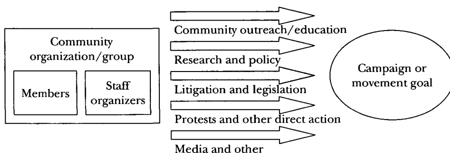
Figure 1 illustrates how community groups incorporate our legal services into their multi-pronged campaigns.

While the CDP’s work for these community organizations or groups is significant, litigation is not the sole means or end in a community group’s campaign for social change. 5 In our workers’ rights cases, the community organization, client-members of the organization, and CDP lawyers cooperate to achieve legal and non-legal goals. Ideally, the legal work reflects harmony among clients, organizers, the organization itself, and us lawyers. In tandem with the litigation, the organizers or community group engage in related, non-legal work—from assembling supportive pickets and press conferences to accompanying client-workers to meetings and serving as interpreters. The lawyers do not participate in the formation of organizing strategies; nor are they involved with protests or other direct actions.